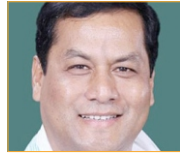
Sarbananda Sonowal Chief Minister, Government of Assam