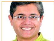
Baijayant 'Jay' Panda