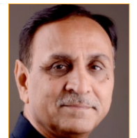
Vijay Rupani Chief Minister, Gujarat