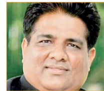
Bhupender Yadav National General Secretary, BJP, Member of Parliament, Rajya Sabha