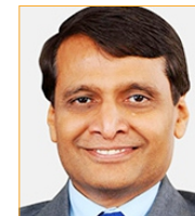
Suresh Prabhu Member of Parliament, India