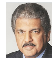
Anand Mahindra Chairman, Mahindra Group