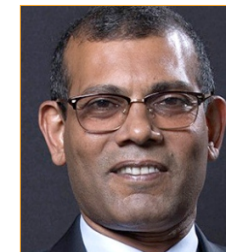
Mohammed Nasheed Speaker, Peoples' Majlis of Maldives