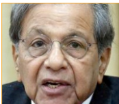
NK Singh Chairman, 15th Finance Commission