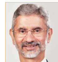
S Jaishankar External Affairs Minister, Government of India