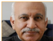
M J Akbar