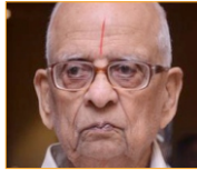
K Parasaran Chairman, Ram Janmabhoomi Teerth Kshetra Trust